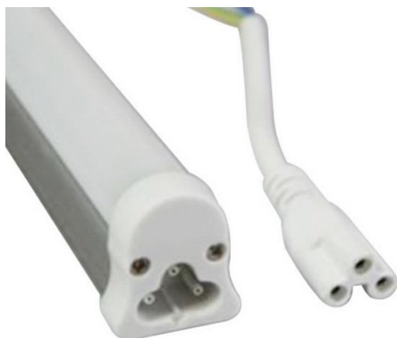
a. Integrative T5 LED Tube

LED Chips: SMD3014 Size: 600mm, 900mm, 1200mm, 1500mm Power: 5W, 10W, 15W, 21W Lumen: 90~100lm/W PF: >95% CIR: >80 Voltage: AC85~265V CCT: 2700~6500K Sockets: no fixture needed, can be installation directly PC Cover: Clear, milky cover