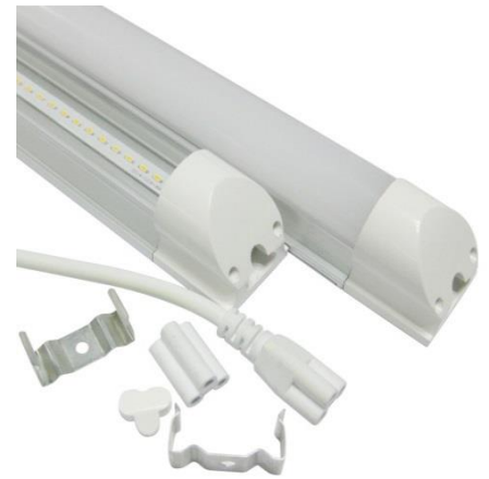
d. U Shape T8 LED Tube